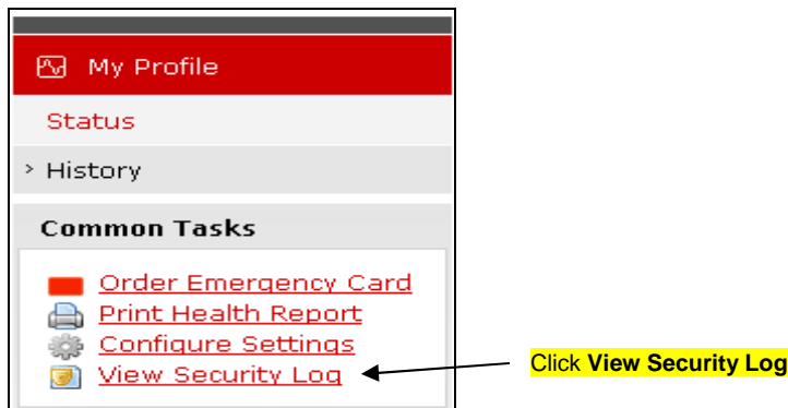
Fig 1 Reviewing the security log – View Security log link.